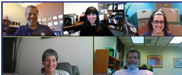
Your CAI leadership hard at work!

Look for our schedule of upcoming Zoom & Facebook LIVE services on page 6!