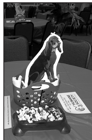
Pet item centerpiece baskets & “kibble” to nibble (popcorn, pretzels, licorice & chocolate chips)