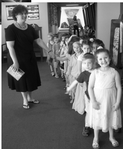
Members of the Giborim(3-year-olds) class anxiously awaited their turn to enter the sanctuary.