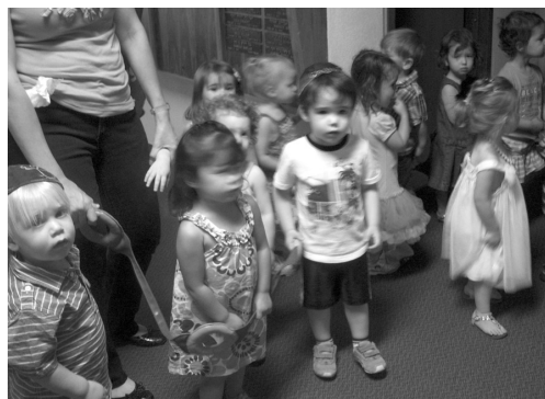
Members of the Par Par (18 months-old) class awaited entering the sanctuary.