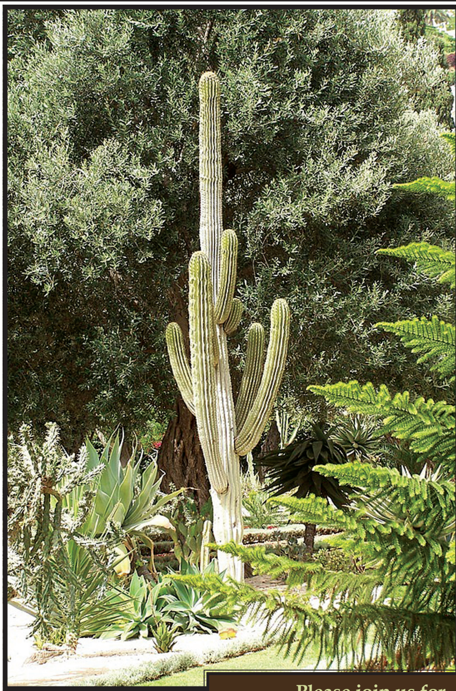
Olive trees and cactus in Haifa, Israel