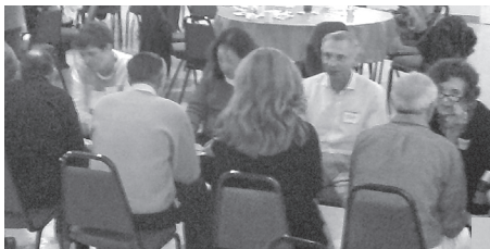
The "Speed Meeting" game