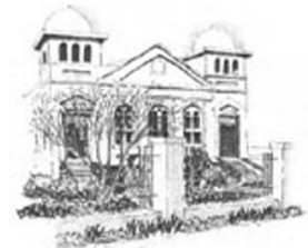
Jewish History Museum